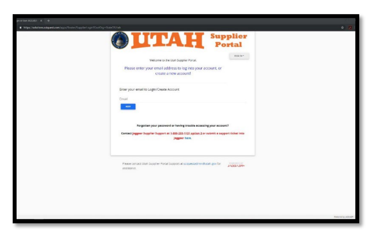
Just fill in your email address and follow the prompts.

The first step to working on DFCM projects is to create a U3P account (the State's supplier portal). Not only do we post solicitations for our projects on U3P, but we also post solicitations letting you know when our semi-annual contractor prequalification periods will be open. The contract pre-qualification periods only open twice yearly, and many of our project solicitations are only available to pre-qualified contractors. Be sure to register now so you don't miss out!