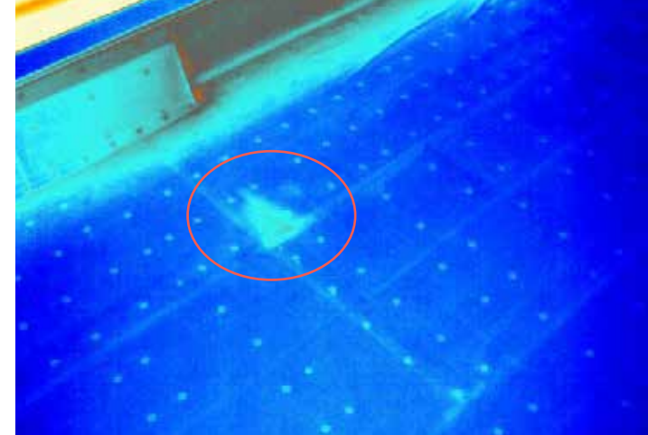
Above: A restroom remodel at the Utah National Guard. Below: Aerial infrared image of a recently detected roof leak at a state-owned facility.