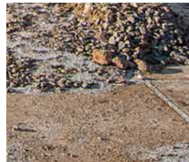
Stair Replacement & Waterproofing Matheson Courthouse